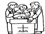
I baptize you in the name of the Father, and of the Son, and of the Holy Spirit.

If you are planning a baptism for a six year old or younger child, come by the parish office to pick up a registration packet. Baptisms are conducted on the first Saturday of each month in English and the third Saturday of each month in Spanish. It is recommended to plan ahead if a specific date is desired, as all baptism requirements must be completed at least two weeks before the baptism date.