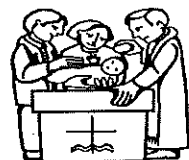
I baptize you in the name of the Father and of the Son and of the Holy Spirit.

This class is a requirement for both parents and godparents prior to a child's baptism. The class is free for registered parishioners and $25 for non-parishioners. Please sign up in advance at the parish office.